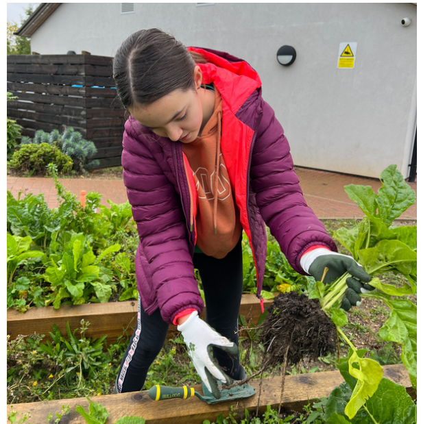
Harvesting the crops we planted in the Summer.

Finally, if you have any time to spare, we are always on the lookout for volunteers - if you think you might be able to help out, let us know!