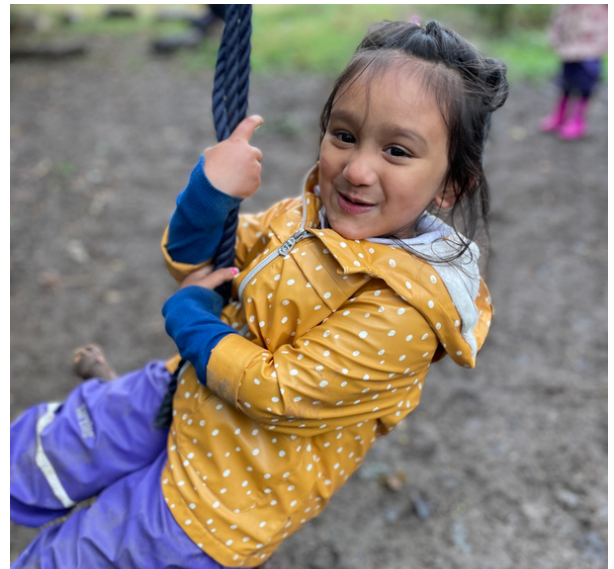
All smiles in Forest School with Little Acorns.

What will you do to make someone smile this week?